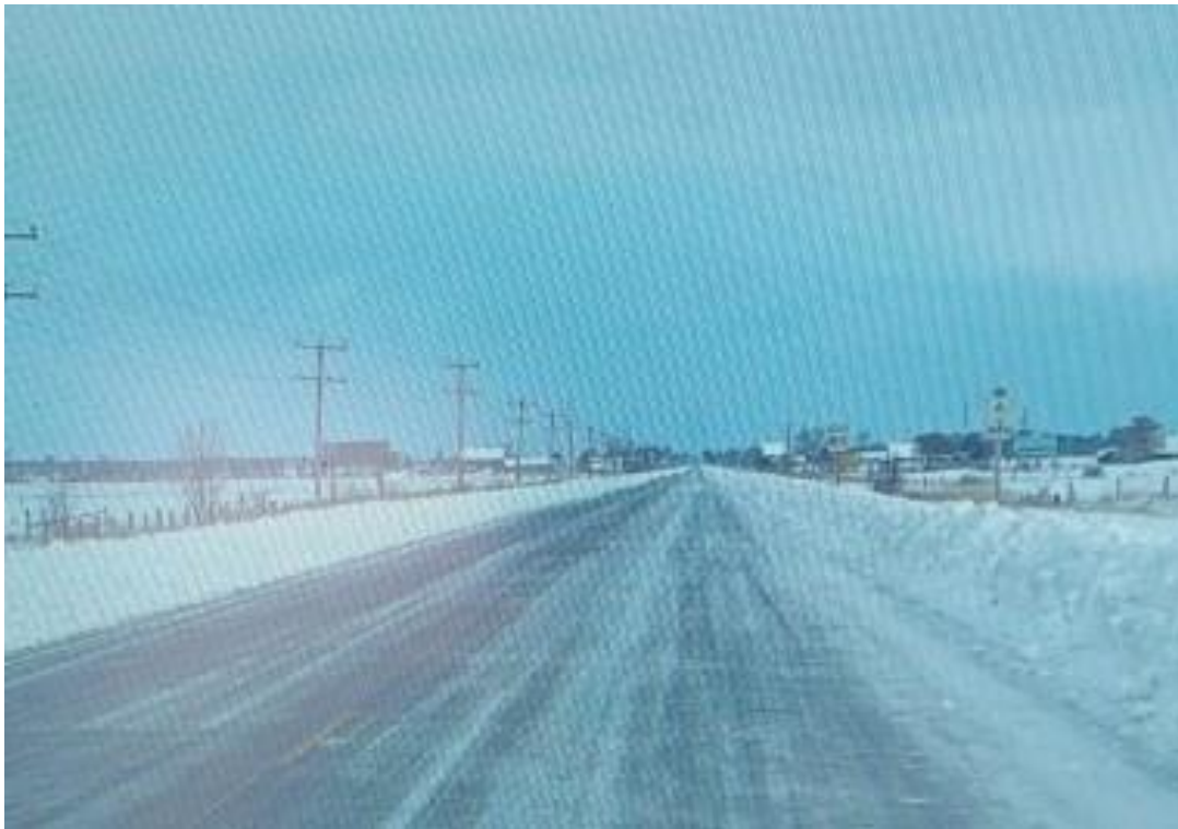
Highway 6, November 18, 2022

Winter arrived early this year, travel warnings continue; looks as if it will be present until next spring. Thanks to climate change, we will doubtless experience some unsettled and changing weather over the winter season.